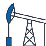
Oil & Gas/Refining