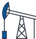
Oil & Gas/Refining