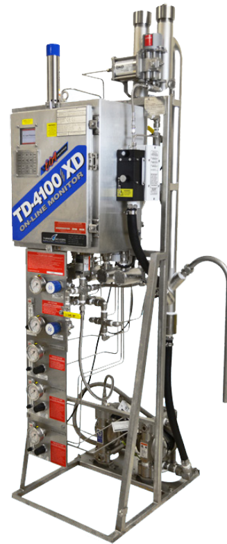
TD-4100 XD oil in water monitor