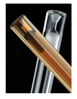
Got used liners? SilcoTek offers redeactivation services!

Certain species e.g. H<sub>2</sub>S tend to readily adsorb to steel surfaces much more drastically than others, causing false and unstable analytical readings [1]. Prior to inert coating technology, passivation was a frequently chosen technique for stablizing the analytical system. Studies have shown that, for gas phase transport at low temperature, flowing sulfur compounds through the sample pathway will cause them to adsorb onto active sites of the steel, creating a passive surface for the actual sample to flow through afterward (a.k.a. "priming") [2]. However, this is an extremely limited, time-consuming solution that is not feasible for meeting the now rigorous analytical demands in applications dealing with odorants, beverage grade CO<sub>2</sub>, and the production of ethylene and propylene, amongst others. In conjunction with Restek® Corporation, we have examined the adsorption effects of sulfur species on stainless steel sample storage and transfer components in simulated applications via GC.